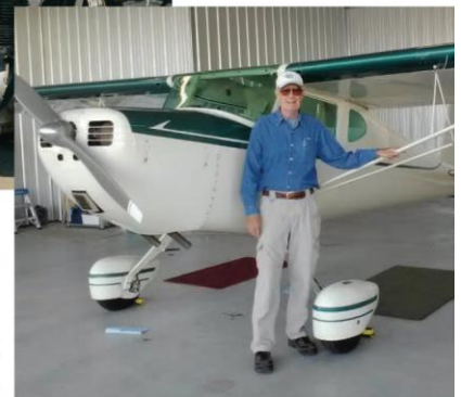
2014; With my fully restored 1947 Cessna 140